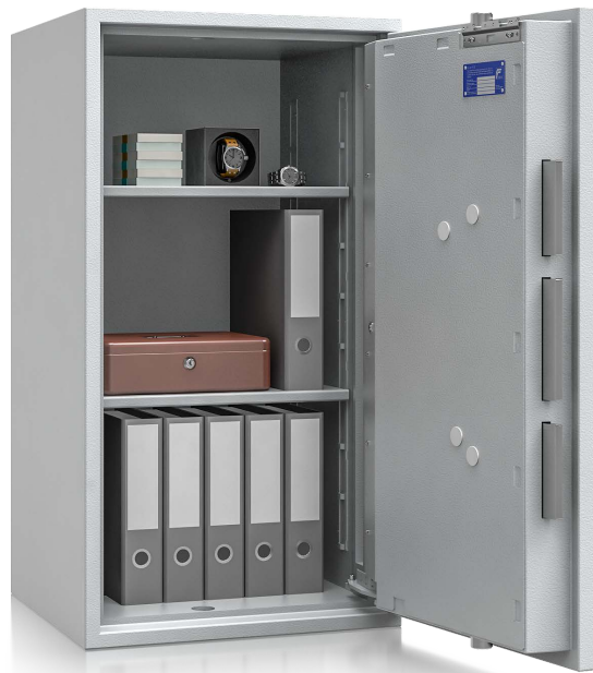
Model EW II-105