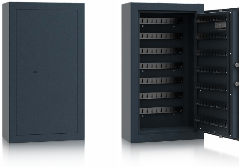
Model STZ 140