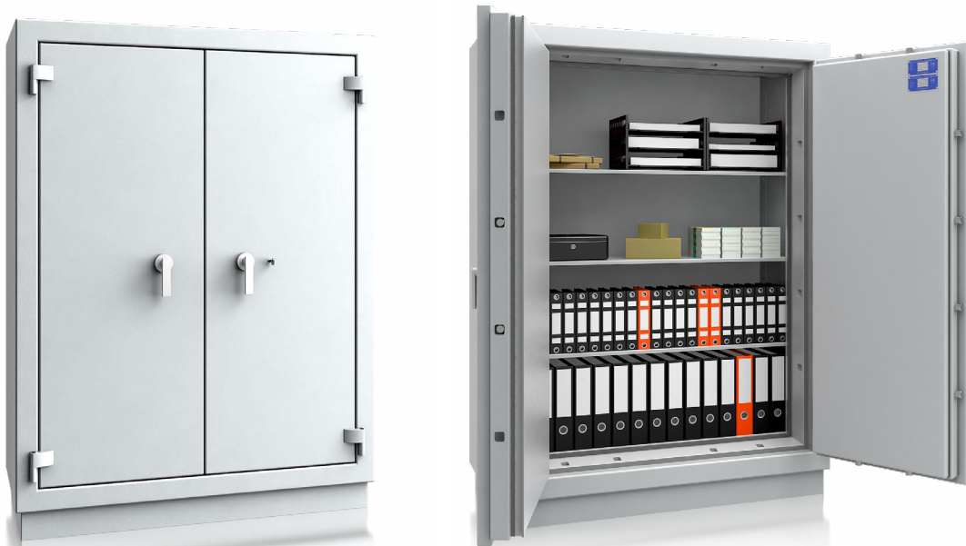
Model PEB 1802/2