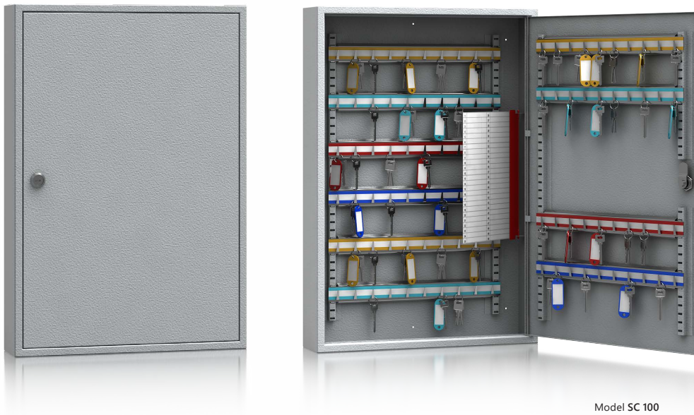
Model SC 100