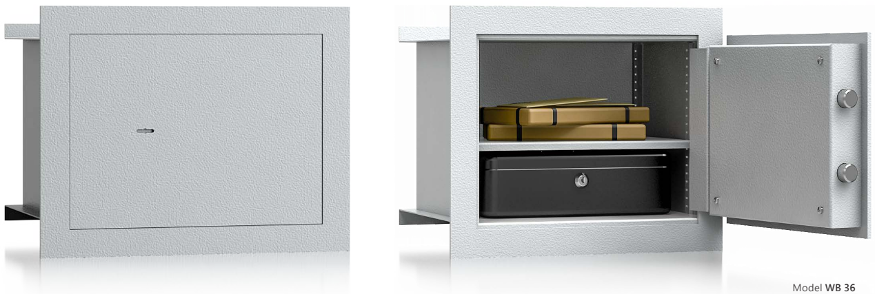
Model WB 36