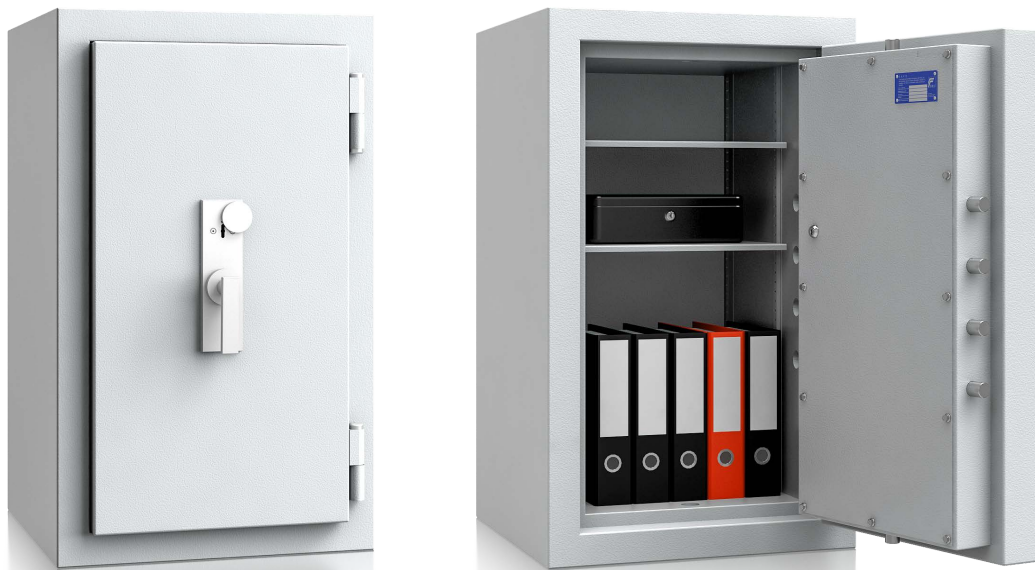
Model EN III-100